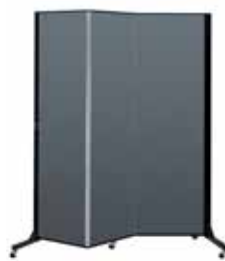
3 Panel 60 lbs., 5'9" long, 6'5" height BFSL683 List $683

Everything on this page is by special order and ships fully assembled.