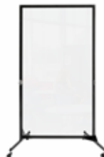
1 Panel 45 lbs., 3'4" long, 6'2" height CRD1 List $979

The perfect choice where "Division with Vision" is desired! Made with 3/16" acrylic panels.