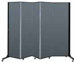
5 Panel 75 lbs., 9'5" long, 6'5" height BFSL685 List $904