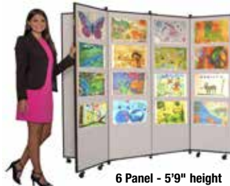
6 Panel - 5'9" height 68 lbs. CDS606 List $1266 6 Panel - 6'5" height 78 lbs. CDS686 List $1429

Display art or any project with three or six winged display towers. Two heights, 38 colors to choose from.