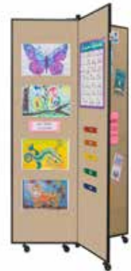
3 Panel - 5'9" height 34 lbs. CDS603 List $733 3 Panel - 6'5" height 39 lbs. CDS683 List $828