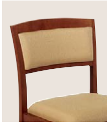
Half Upholstered Back