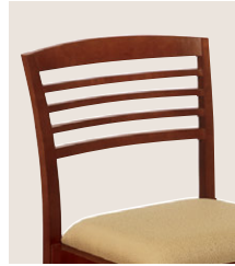
Horizontal Slat Back