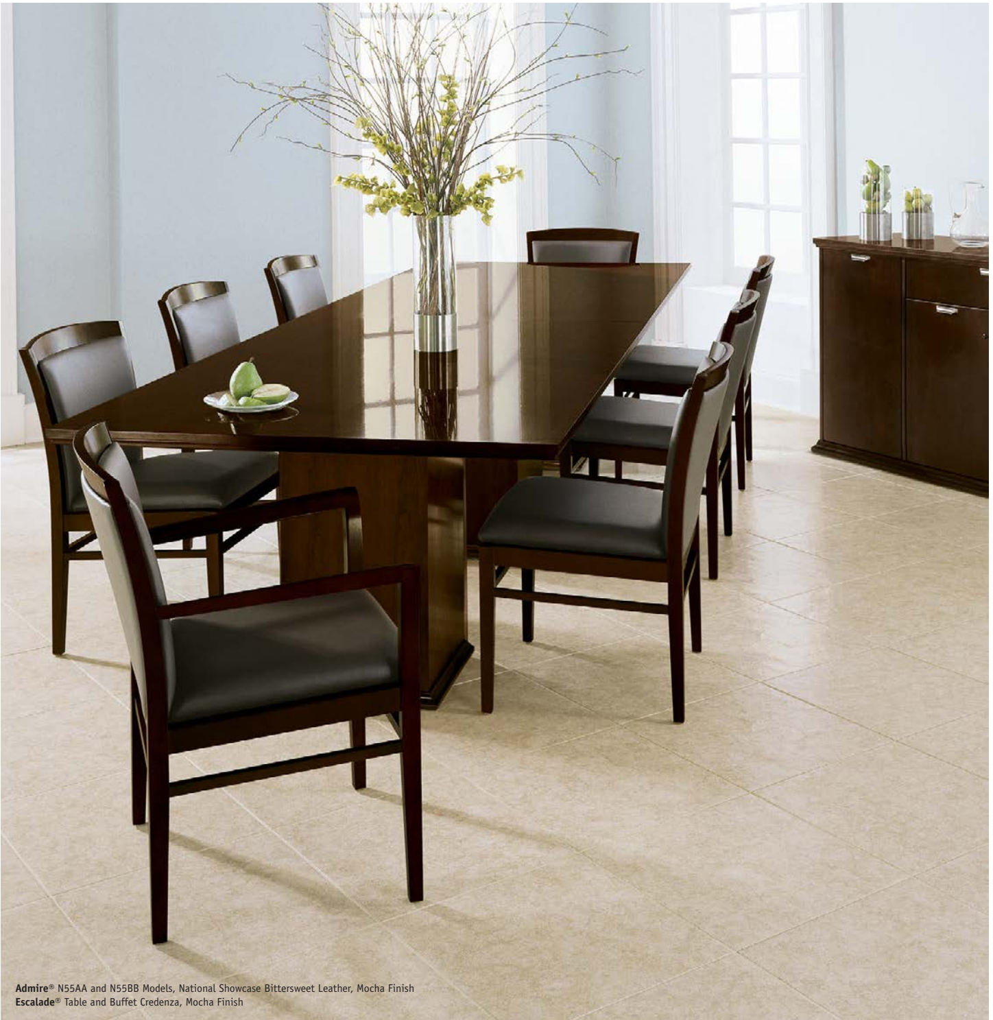
Admire® N55AA and N55BB Models, National Showcase Bittersweet Leather, Mocha Finish Escalade® Table and Buffet Credenza, Mocha Finish

Admire infuses a clean transitional design with pleasing comfort, giving you an ideal seating choice for lobby and reception areas, dining and break areas as well as private offices... anywhere you want people to feel welcome. Specify with or without arms and with horizontal slats or half or fully upholstered back. With a selection of smart fabrics and colors to complement the handsome hardwood frame, you can truly outfit the personality of your space. Equally attractive is the price, proving that solid value is still quite affordable. And, you get National's quality, reliability and environmental commitment with Admire earning level® 2 and SCS Indoor Advantage™ Gold which can contribute to LEED® points.