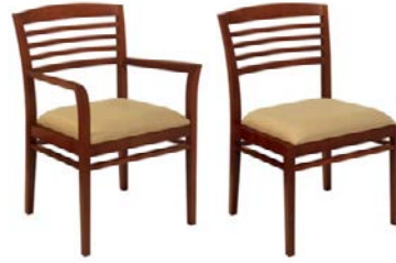
Horizontal Slat Back N55CC N55DD Armless D24" W24" H34"