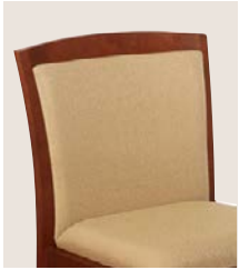
Fully Upholstered Back