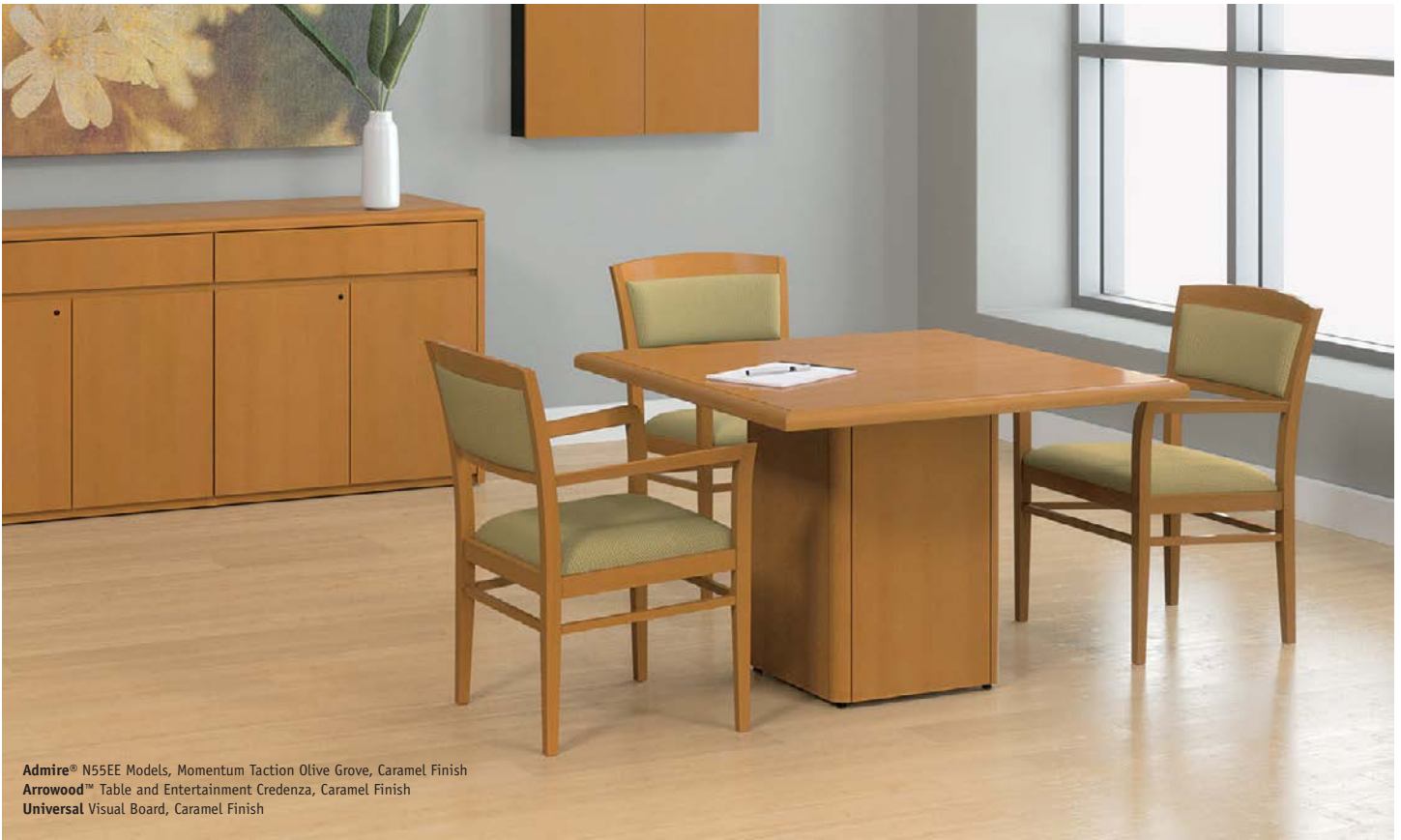
Admire® N55EE Models, Momentum Taction Olive Grove, Caramel Finish Arrowood™ Table and Entertainment Credenza, Caramel Finish Universal Visual Board, Caramel Finish