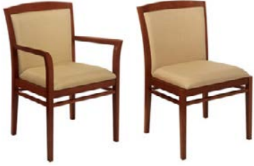
Fully Upholstered Back N55AA N55BB Armless D24" W24" H34"