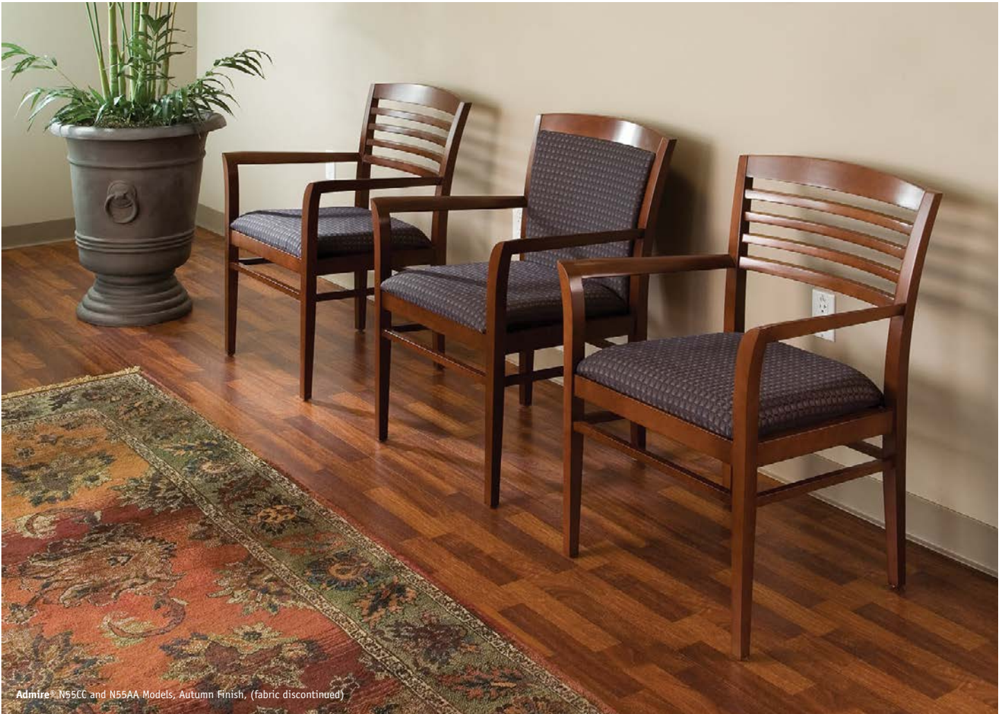
Admire® N55CC and N55AA Models, Autumn Finish, (fabric discontinued)