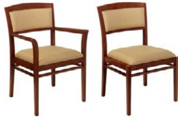
Half Upholstered Back N55EE N55HH Armless D24" W24" H34"